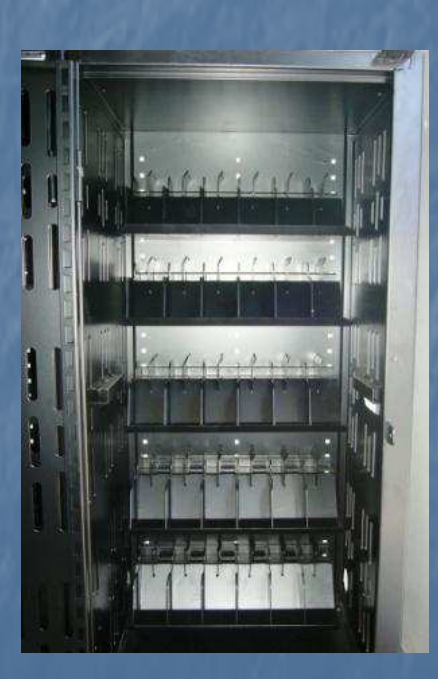
Weapon Storage Cabinet for 10 ea M16/4