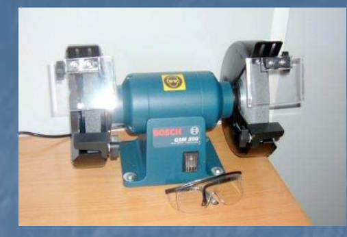
Professional Dual Wheel Grinder