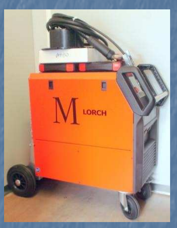
Mig/Mag Welder, 25-170 A