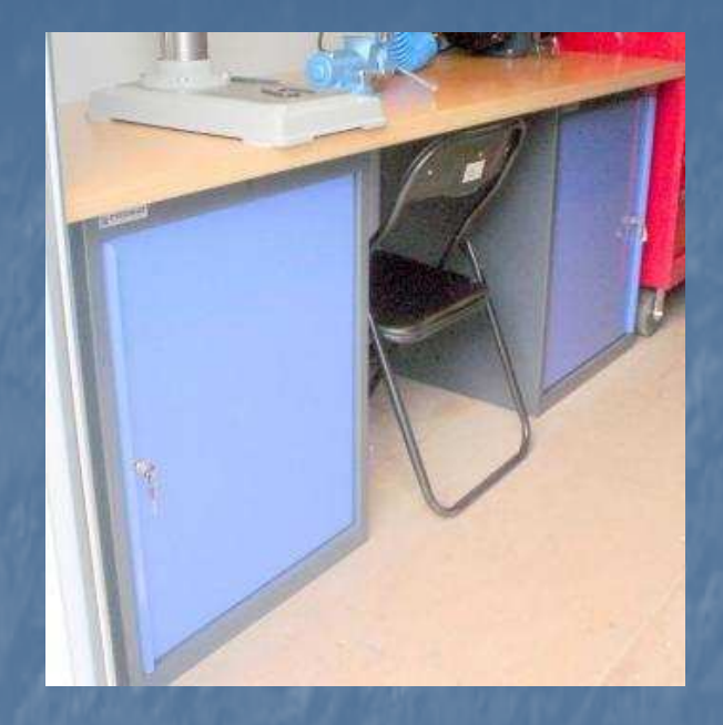
Dual Pedestal Workbench, 40 mm thick wood top, Dimensions; 2000 mm W x 840 mm H x 600 mm D

Industrial Bench Drill Press, 120-2580 rpm