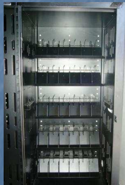
Weapon Storage Cabinet for 10 ea M16/4