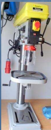
Industrial Bench Drill Press, 120-2580 rpm