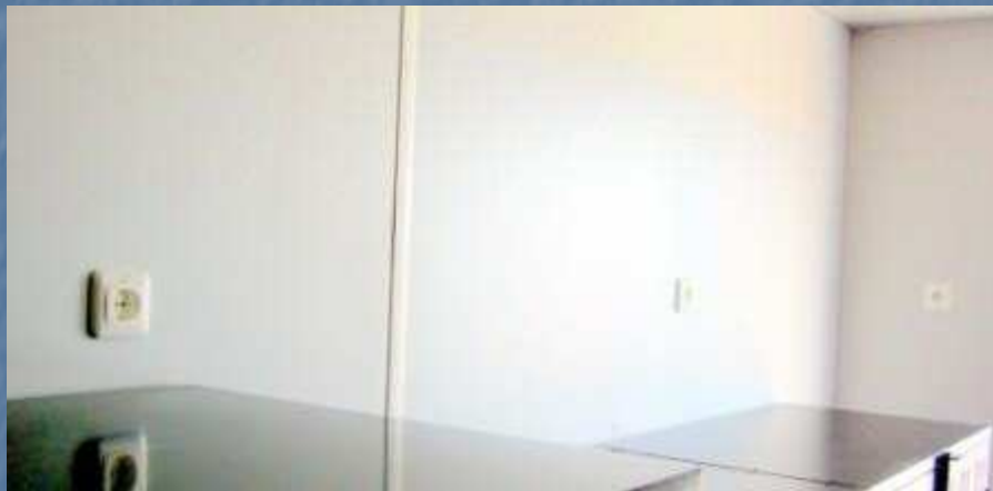
Walls Insulated & Paneled