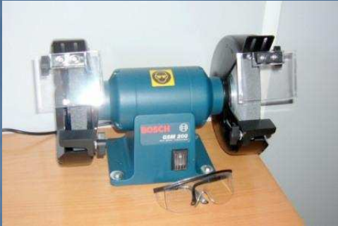
Professional Dual Wheel Grinder