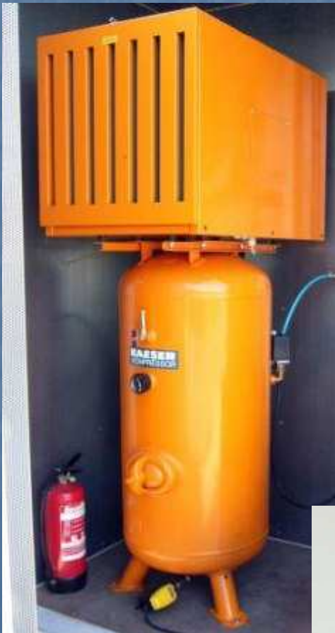
Reciprocating Compressor, single stage, 10 bar, sound enclosure & electronic condensate drain

Maintains power for all of the container components in the absence of an external power source