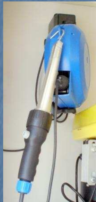
Retractable Drop Lite