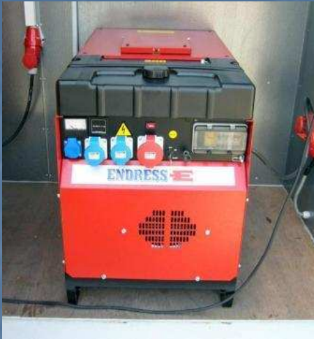
Diesel Operated 7 kw generator

Maintains power for all of the container components in the absence of an external power source