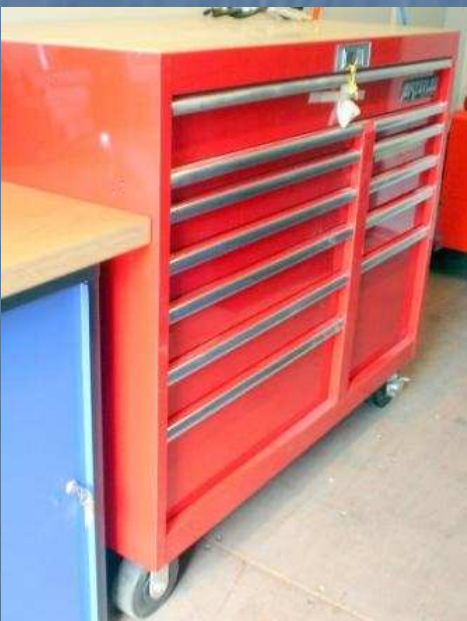
Rolling Tool Chest, 12 Drawers