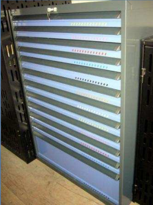
10 Drawer Tool/Spare Parts cabinet, Dimensions; 1000 mm W x 1400 mm H x 700 mm D