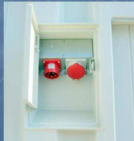
External Power hookup