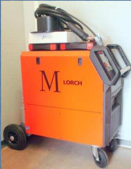
Mig/Mag Welder, 25-170 A