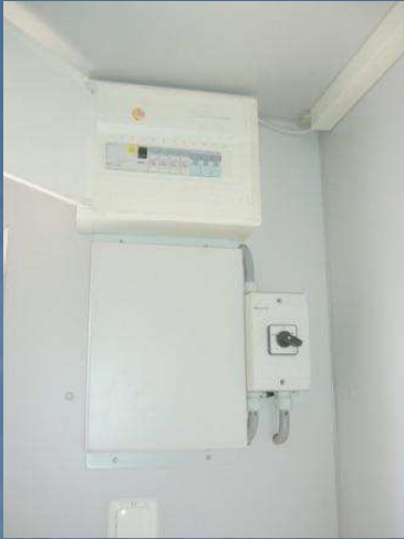
Main Power control Panel