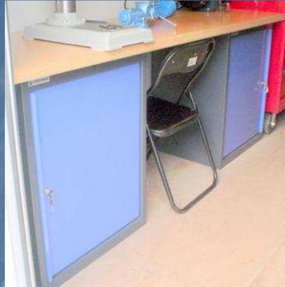
Dual Pedestal Workbench, 40 mm thick wood top, Dimensions; 2000 mm W x 840 mm H x 600 mm D