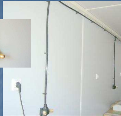
Outlets & Air Drops